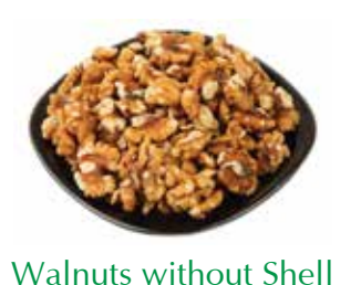
Common Names: Walnut, Akhrot